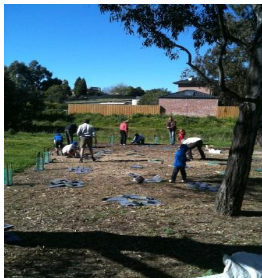
Everyone helping out with the planting