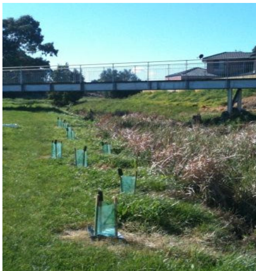
Eucalypts along the riverbank