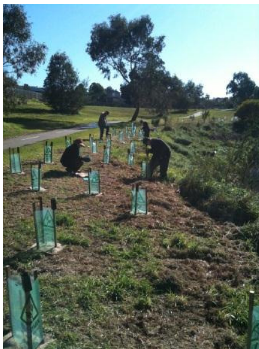
The planting went very well

Of course after a very successful planting day – Michelle had a suitably nourishing coffee, tea, biscuits and fruitcakes available – yummy!!