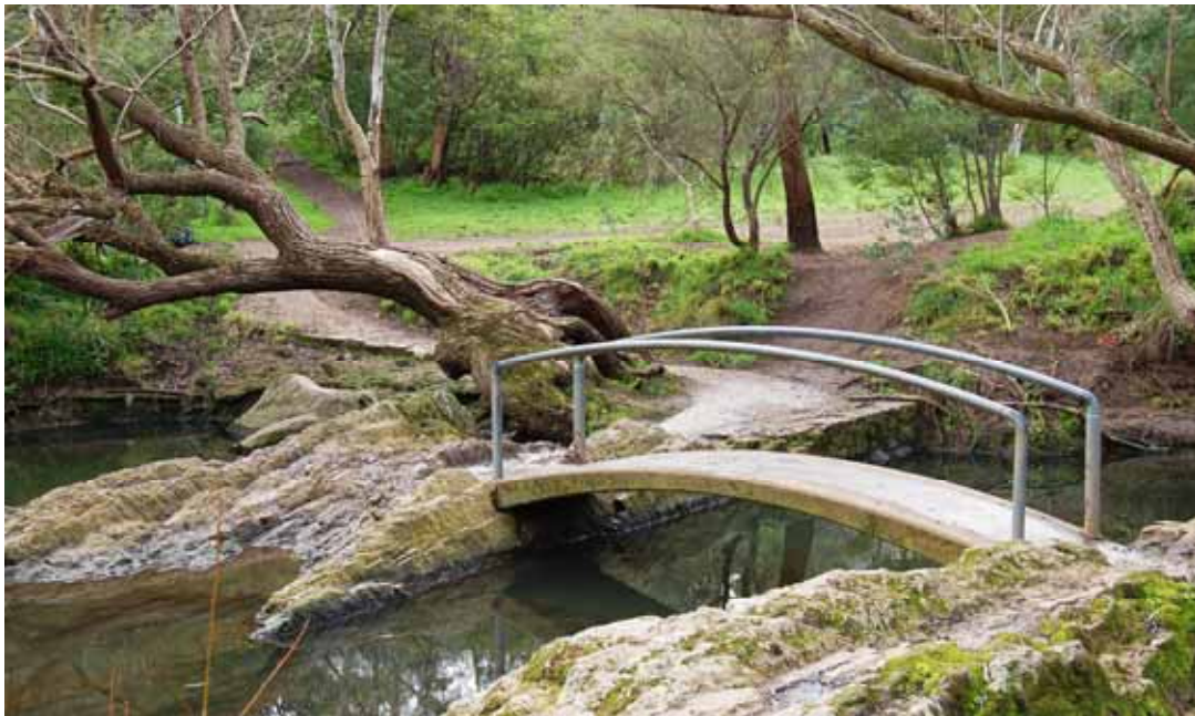
Darebin Parklands