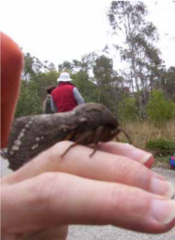
A large moth we discovered whilst weeding.